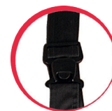
Special buckle construction to avoid loosening