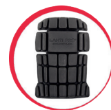
Knee pads for protective trousers and bibpants