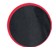
Abrasion-resistant fabric reinforcements