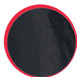
Abrasion-resistant fabric reinforcements

MATERIAL: 35% cotton, 65% polyester. Durable CANVAS fabric. 7 pockets, including 4 with a velcro fastener. Pocket for a mobile phone. Zipper. Mesh ventilation holes with a zipper. Sleeves, yoke, and pockets reinforced with an abrasion-resistant material (600D polyester). Sleeves finished with a drawstring. Width adjustment at the jacket bottom with buttons. ID tag. STANDARD: EN ISO 13688.