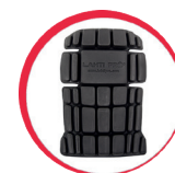
Knee pads for protective trousers and bibpants