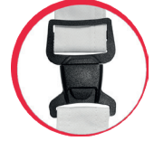
Special buckle construction to avoid loosening