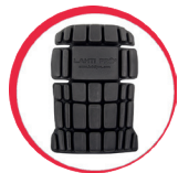
Knee pads for protective trousers and bibpants