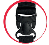
Special buckle construction to avoid loosening