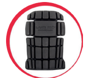
Knee pads for protective trousers and bibpants