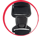
Special buckle construction to avoid loosening