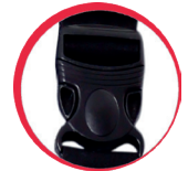
Special buckle construction to avoid loosening