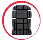
Knee pads for protective trousers and bibpants