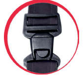
Special buckle construction to avoid loosening