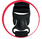
Special buckle construction to avoid loosening