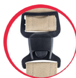
Special buckle construction to avoid loosening

MATERIAL: 100% cotton. 10 pockets, including 6 with a velcro fastener. Pocket for a mobile phone. Triple seams. Waist width adjustment with buttons and an elastic band. Keychain hole. Hammer holder. Reflective elements. Braces with length adjustment. Braces, pockets, and knee pad pockets reinforced with an abrasion-resistant material (600D polyester). ID tag. STANDARD: EN ISO 13688.