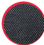
Abrasion-resistant fabric reinforcements