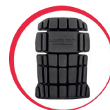
Knee pads for protective trousers and bib pants