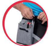
Removable and adjustable tool pockets