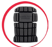
Knee pads for protective trousers and bibpants