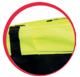
Innovative waist width regulation