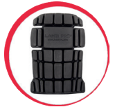
Knee pads for protective trousers and bibpants