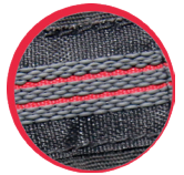
Anti-slip tape at the waist