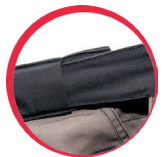
Innovative waist width regulation