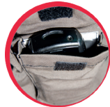
Electromagnetic radiation protection