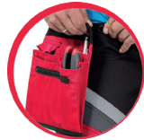
Removable and adjustable tool pockets