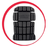
Knee pads for protective trousers and bibpants