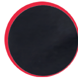
Abrasion-resistant fabric reinforcements