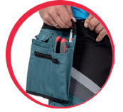
Removable and adjustable tool pockets