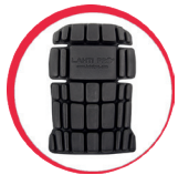
Knee pads for protective trousers and bibpants