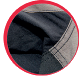
Stretch inserts from a "4-way elastic" fabric