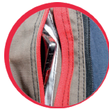
Electromagnetic radiation protection