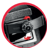
Adjustable head straps